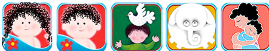
"Once Upon a Potty", "Once Upon a Bird", "Once Upon an Elephant", "Once Upon a Mother", "Joshua & Prudence" are registered trademarks, used by permission.